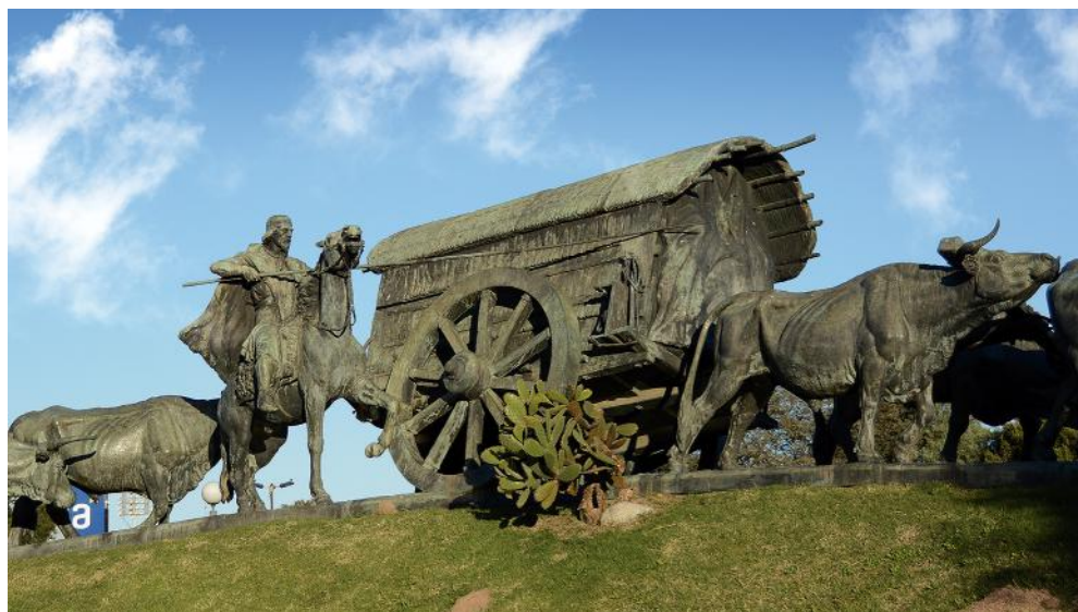
"La Carreta" Monument, by José Belloni Montevideo

To promote services with higher perceived value.