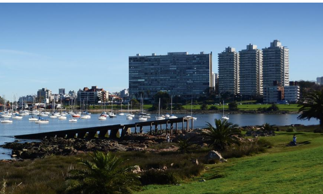
Port of Buqueo - Montevideo

The Core Project is also making progress in coordination with "Vision 2020", so that the new system is consistent with the "BROU 2020" vision.